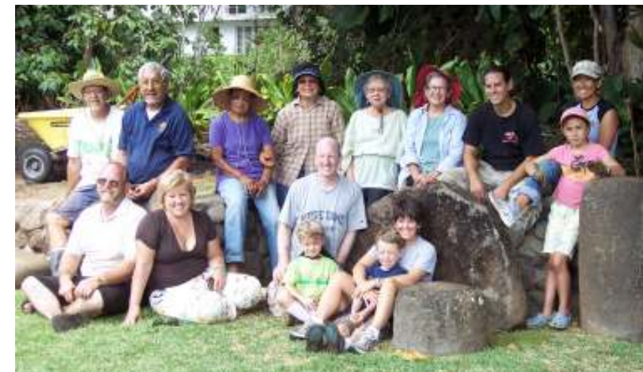
Mahalo to the Bailey `Ohana for planting the new native plants at Bailey House on August 8th!