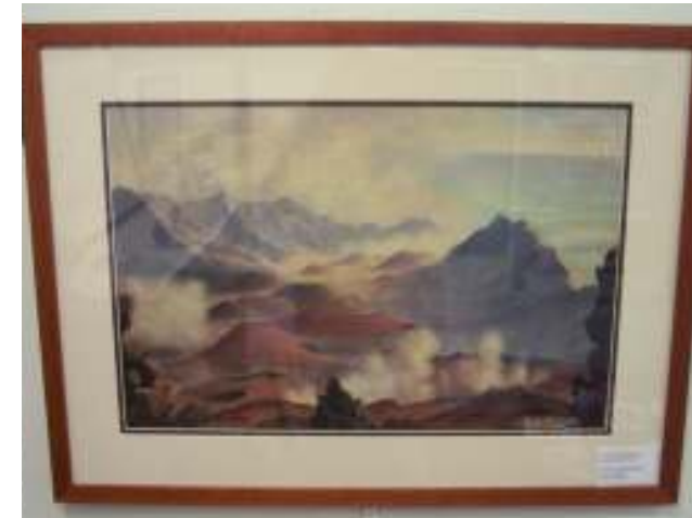
Craters of Haleakala $155

We are still seeking funding to continue paintings restoration. Please call for details.