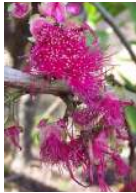
'Ōhi'a 'ai blooming in the Bailey House garden