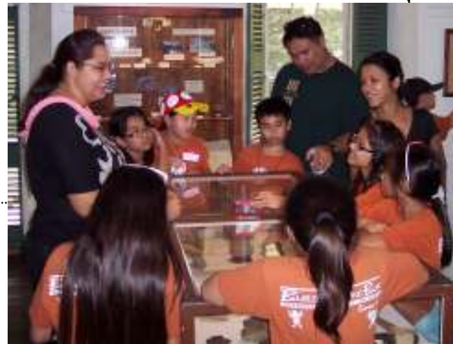
Right: Hawaii Baptist Academy school tour, February 2011