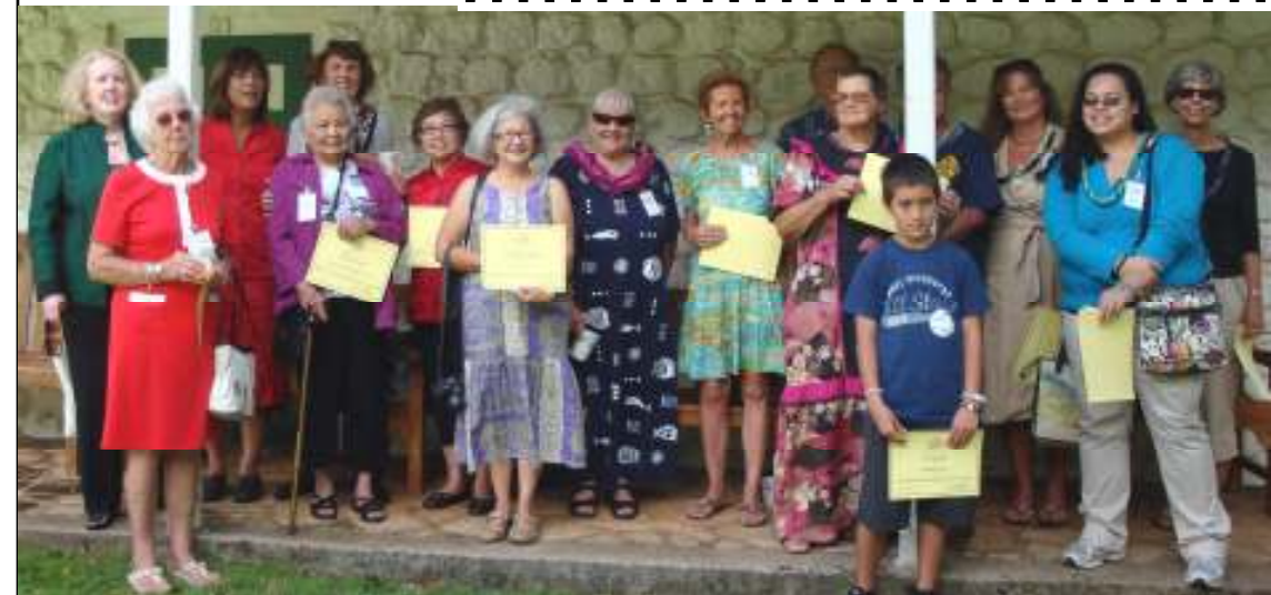
Volunteer Luncheon March 2011 Mahalo to our wonderful volunteers!!