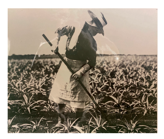
Baldwin Farmworker

Pono Practices and Farming Before the plantation era in Hawaii native Hawaiians harnessed vast wisdom and foresight in managing their natural resources, recognizing the importance of balanced stewardship toward the land and ocean to ensure abundance for themselves and future generations. Reviving and reimplementing pono (rightful, proper) practices is a positive step to go forward.